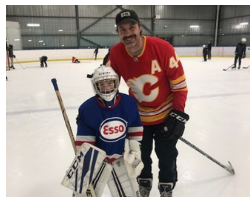
Children and youth in CPYF Funded Programs (L-R: Calgary Police Cadet Corps, Bridges to Brighter Futures & Power Play)

Thank you to our friends at Corus Entertainment for being our official CPYF media partners! By sharing our stories with your audience, you are helping to support children and youth in our community, keeping them safe from victimisation and crime. Thank you for your ongoing support!