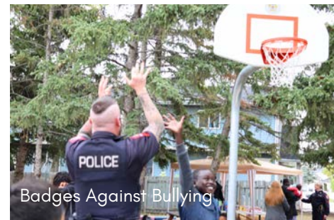
Badges Against Bullying

HOLIDAY HAMPERS DELIVERED TO CHILDREN, YOUTH, AND FAMILIES