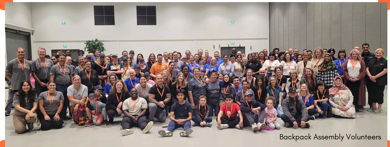
Backpack Assembly Volunteers

12 CPS DISTRICT OFFICE COMMUNITY EVENTS HOSTED