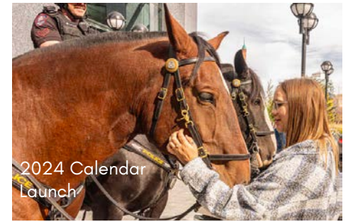
2024 Calendar Launch