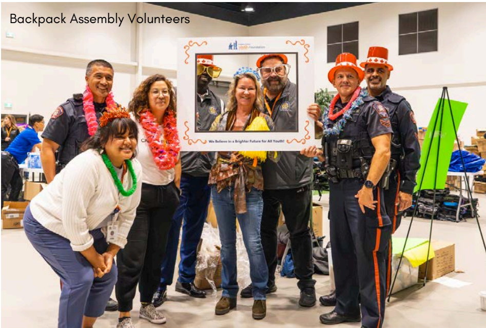
Backpack Assembly Volunteers