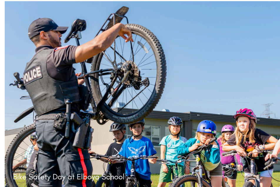
Bike Safety Day at Elboya School