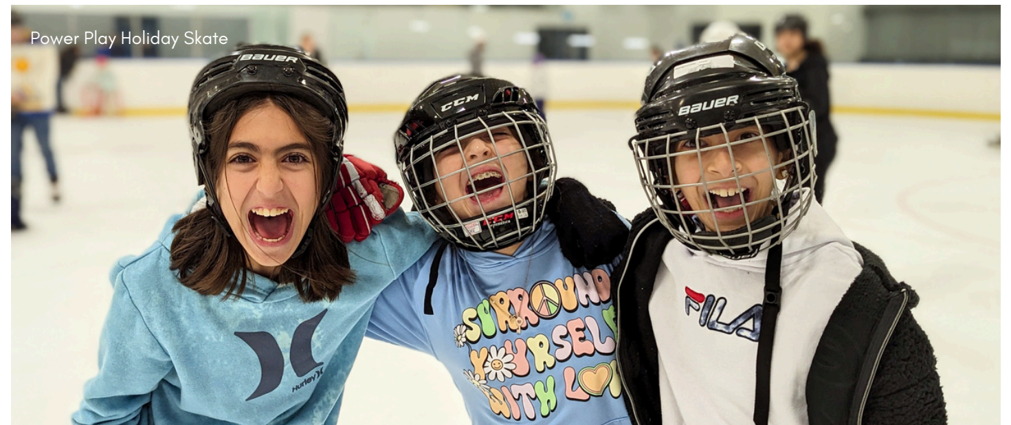
Power Play Holiday Skate

CHILDREN AND YOUTH SUPPORTED IN 2023 THROUGH CPYF PROGRAMS