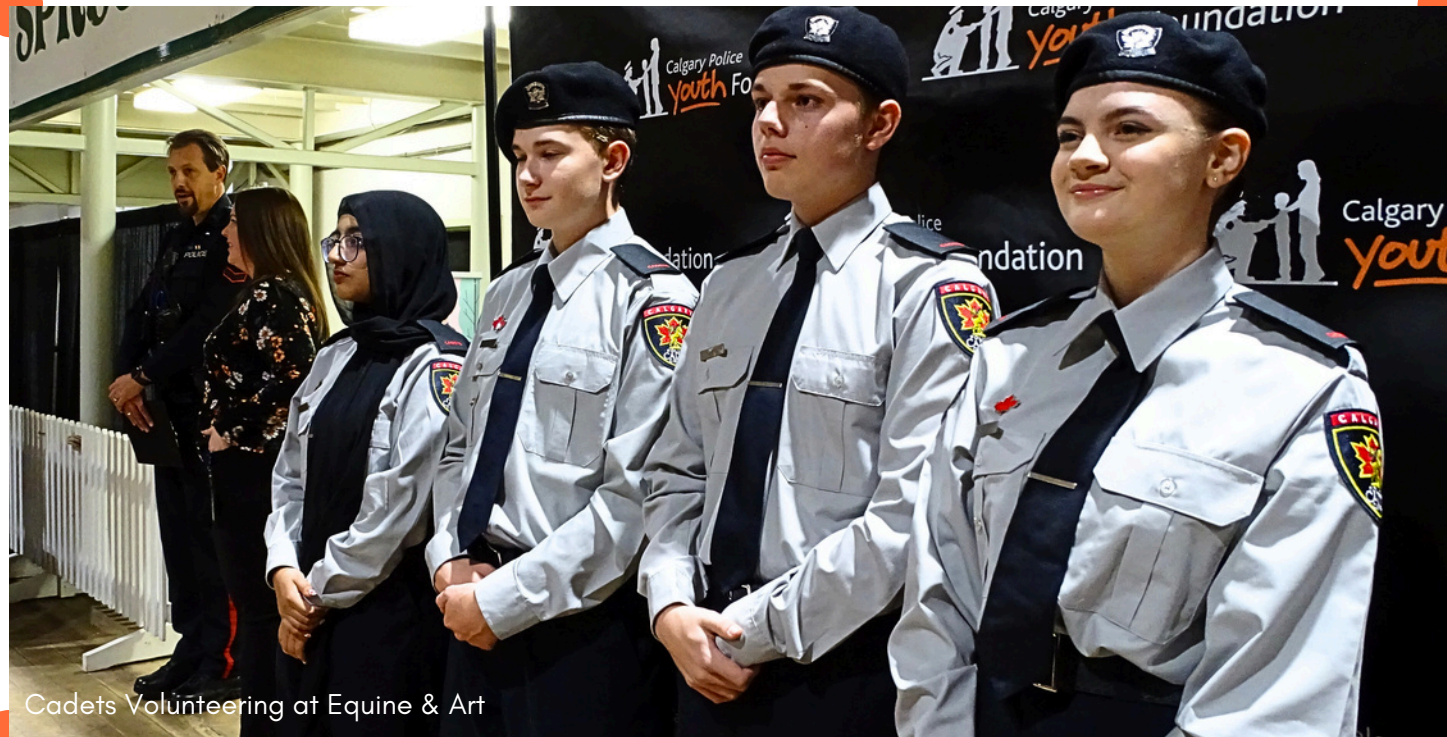
Cadets Volunteering at Equine & Art

CADETS COMPLETED 26 VOLUNTEER ACTIVITIES IN 2023