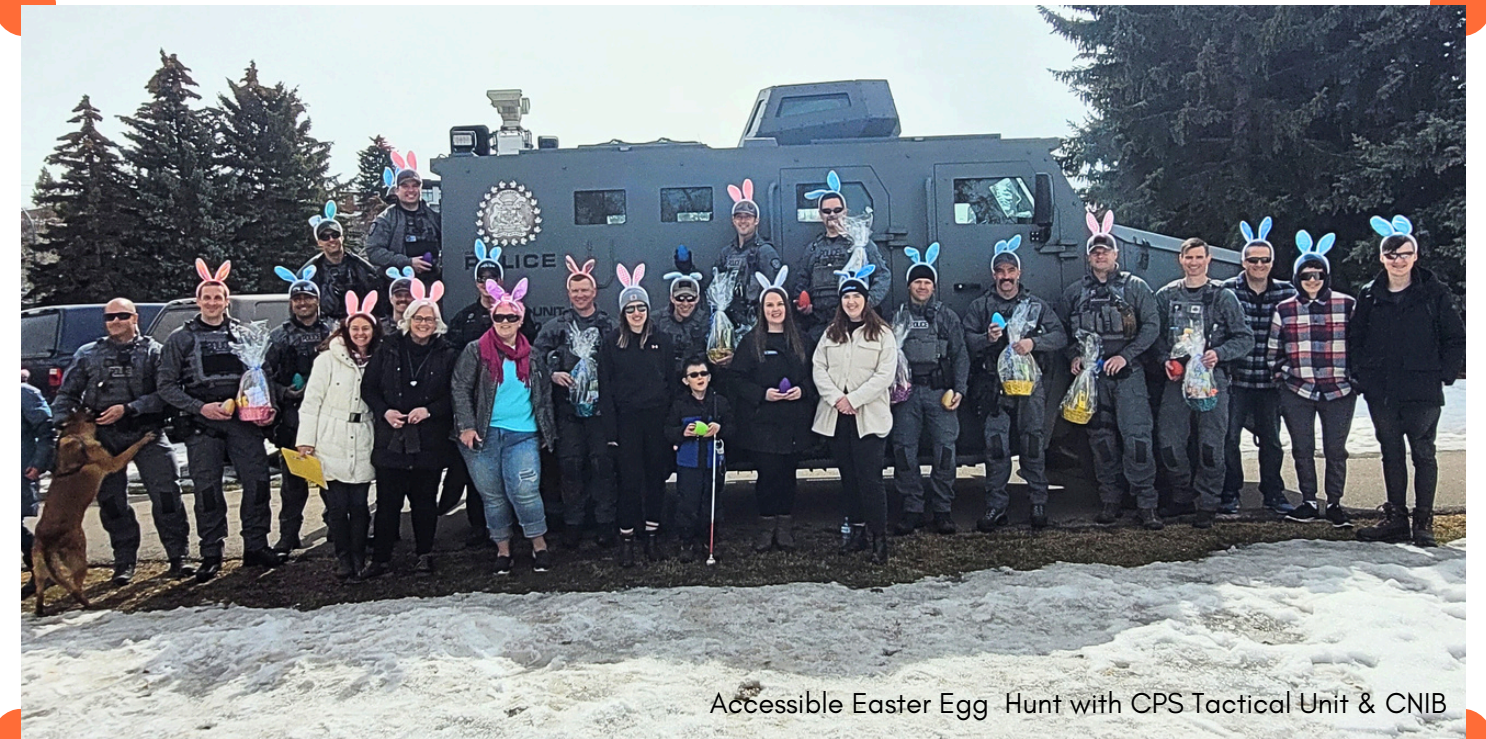
Accessible Easter Egg Hunt with CPS Tactical Unit & CNIB