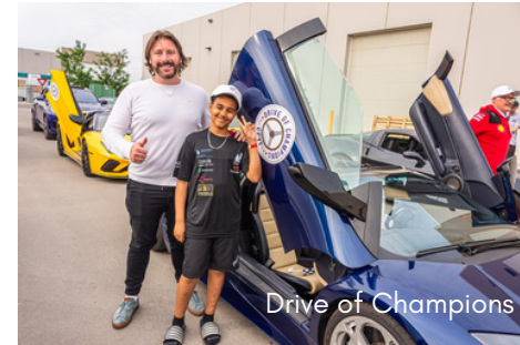
Drive of Champions

CHILDREN AND YOUTH ATTENDED A CYBER SAFETY DAY PRESENTATION