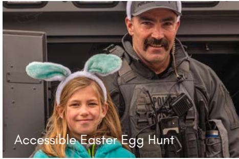
Accessible Easter Egg Hunt

STUDENTS PROVIDED WITH HEALTHY SNACKS THROUGH OPERATION SNACK TIME