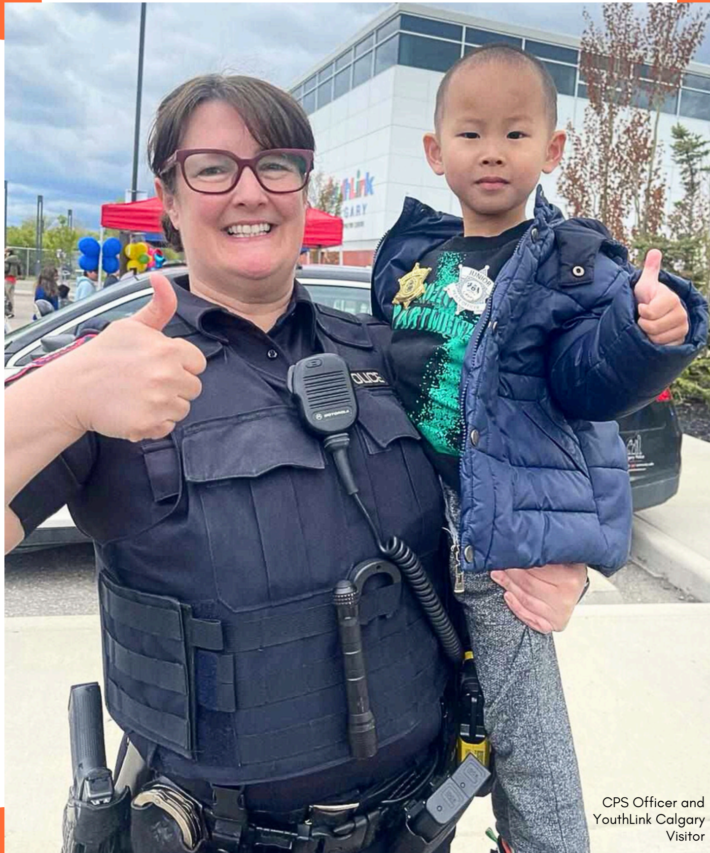
CPS Officer and YouthLink Calgary Visitor