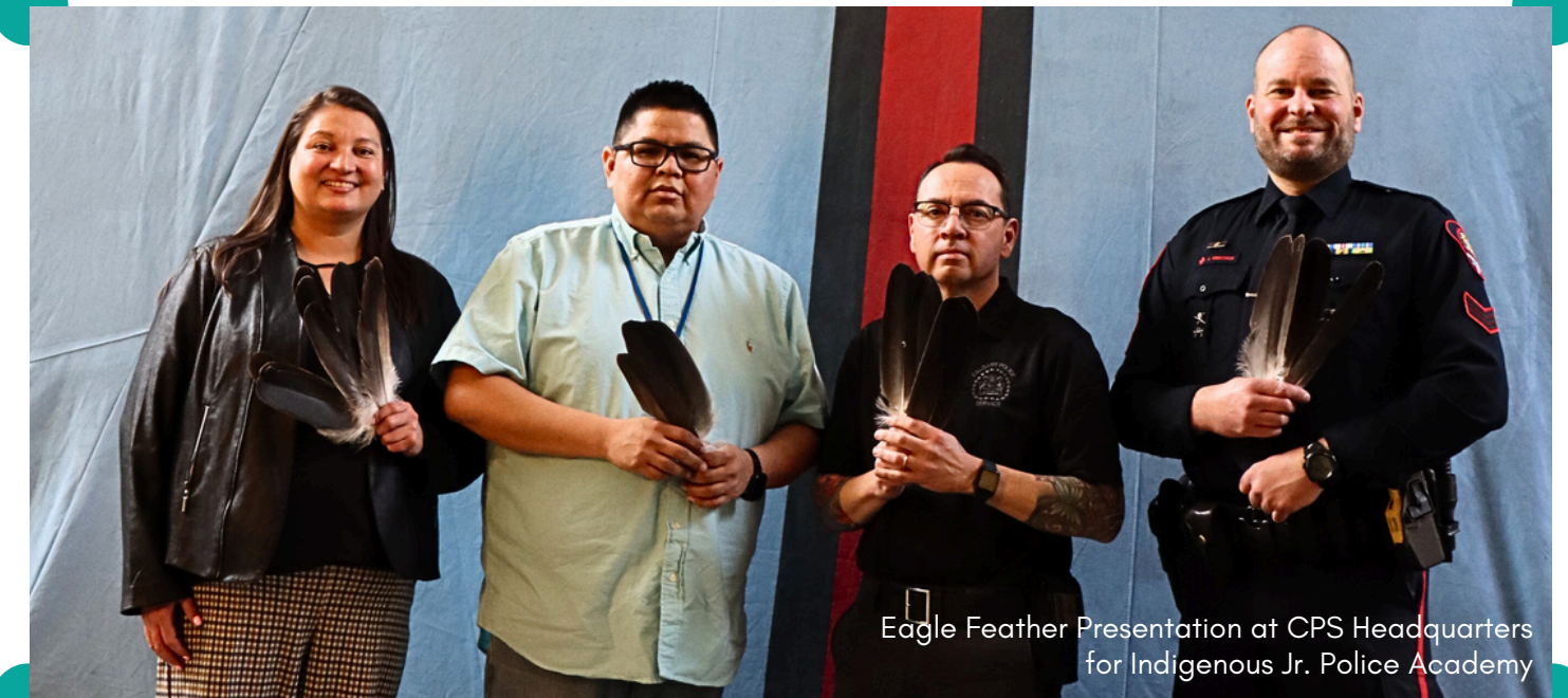
Eagle Feather Presentation at CPS Headquarters for Indigenous Jr. Police Academy

Similarly, CPYF recognizes the inequities and systemic discrimination that continues to exist within numerous organizational structures; with guidance from Indigenous communities and leaders, we continually reflect on the ways in which program access and equity can be improved.