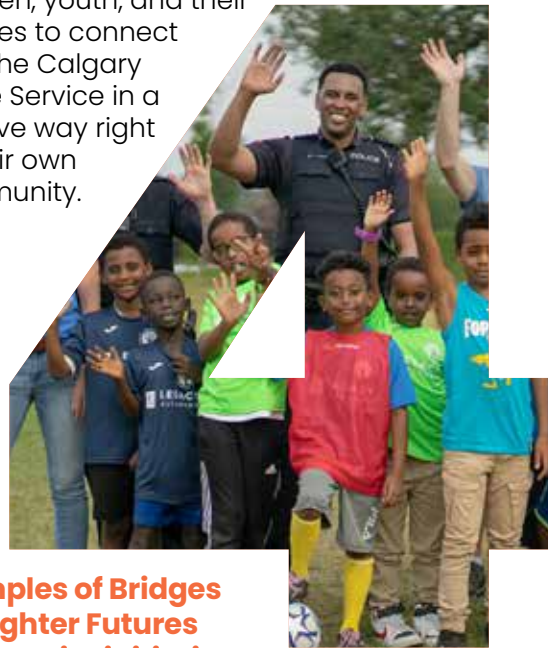
Examples of Bridges to Brighter Futures community initiatives:

Bridges to Brighter Futures is a child and youth crime prevention, education and intervention program which includes multiple and targeted community engagement initiatives led by the Calgary Police Service with support from the Calgary Police Youth Foundation. The common thread that ties all these initiatives together is the opportunity for children, youth, and their families to connect with the Calgary Police Service in a positive way right in their own community.